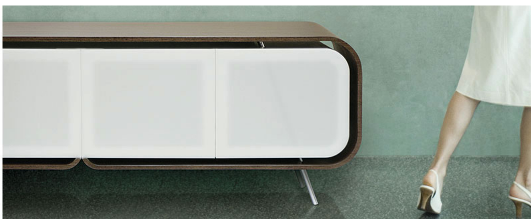
Above: HTC Diamond Smart Phone. Middle: MGX. Below: The Aura Credenza for Council.