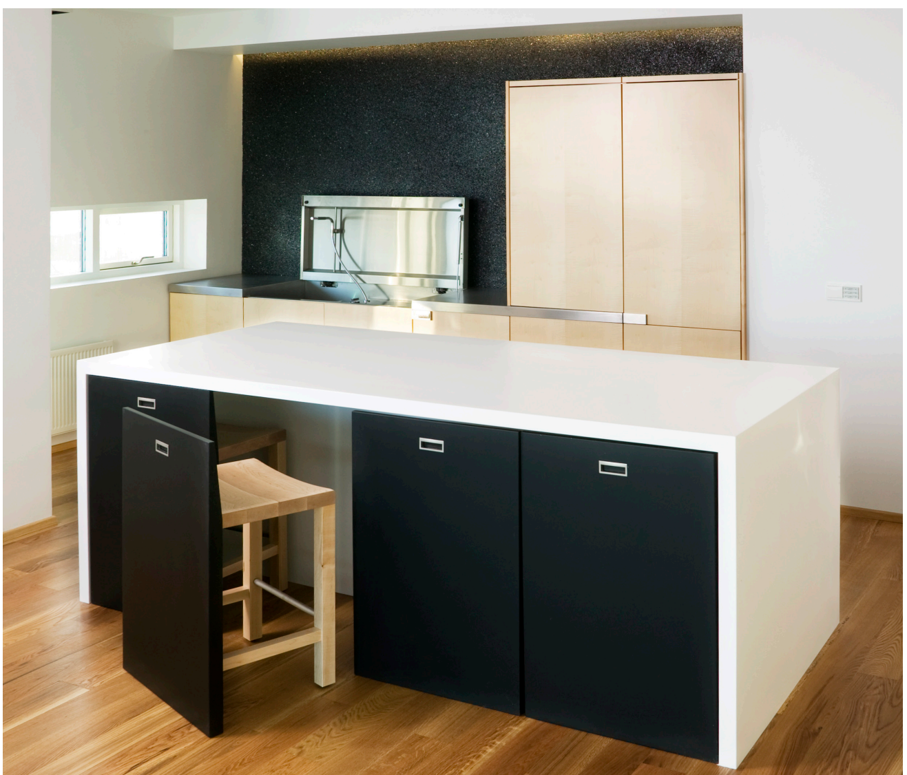
Above: Greenfield Living Penthouse Apartment. Below: Lava Living Penthouse Apartment.