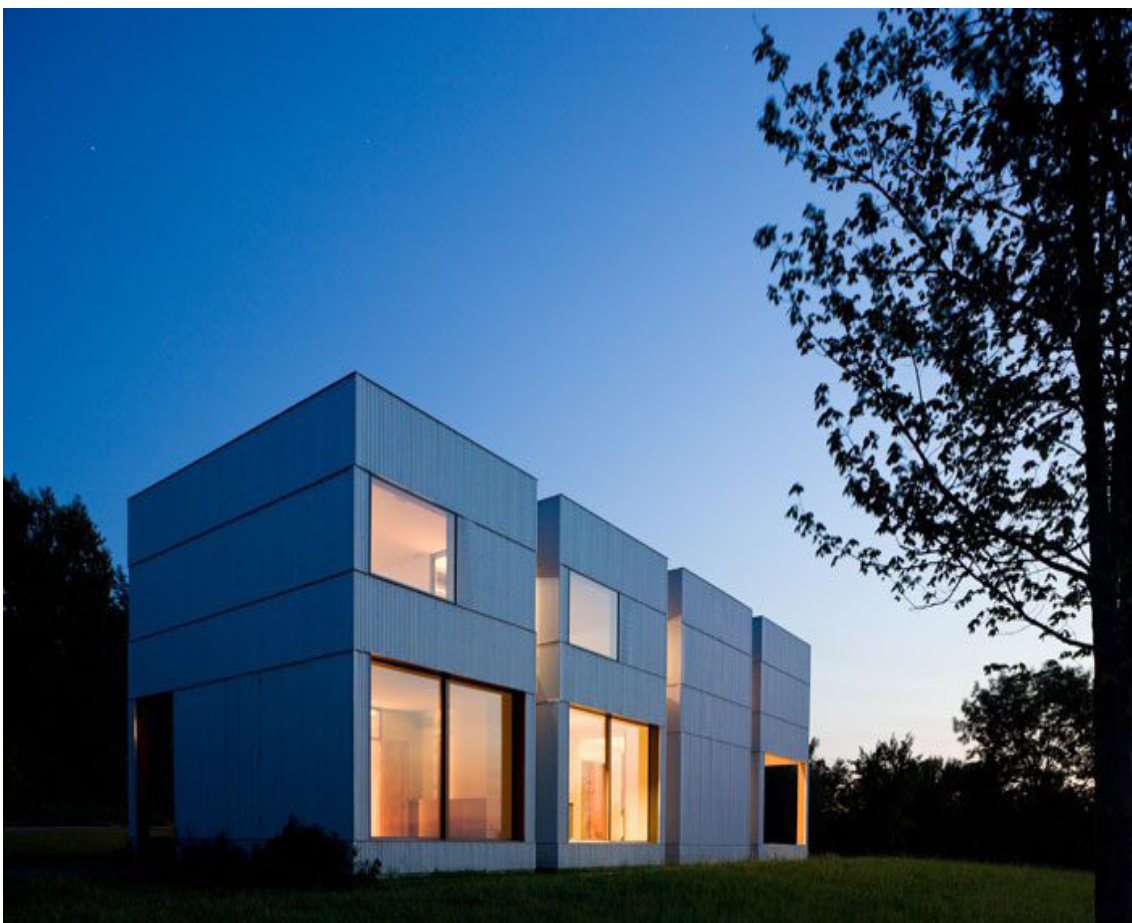
Above: Cafeteria Kirschgarten. Below: Tsai Residence.