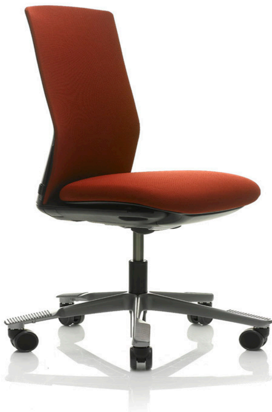
Above: Armadillo Body Armor. Below: Futu Chair.