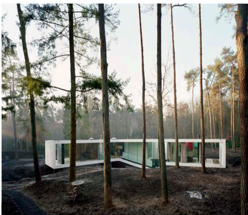
Above: Spiral House. Below: Villa 1.