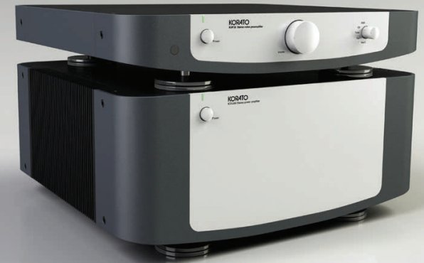
High end audio pre and amplifiers